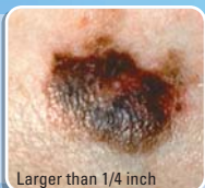
Larger than 1/4 inch