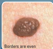
Borders are even

If you draw a line through this mole, the two halves will not match.