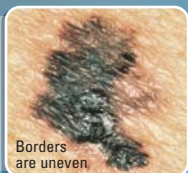
Borders are uneven