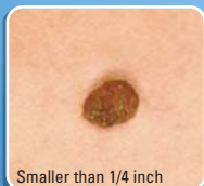
Smaller than 1/4 inch

Having a variety of colors is another warning signal. A number of different shades of brown, tan or black could appear. A melanoma may also become red, blue or some other color